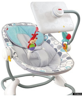
Fig. 5. An iPad for entertaining a baby.

article describes the problem in great depth [45]. An empirical study of the problem was published in 2013 [46].