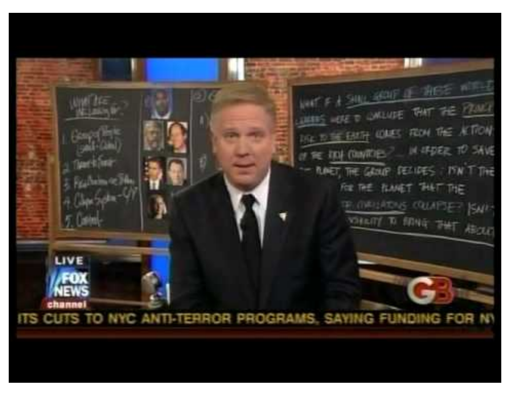
Watch Video At: https://youtu.be/Fczbpc8XW7k

Glenn Beck Part 1: UN Maurice Strong United Nations, Fox News (5 mins)